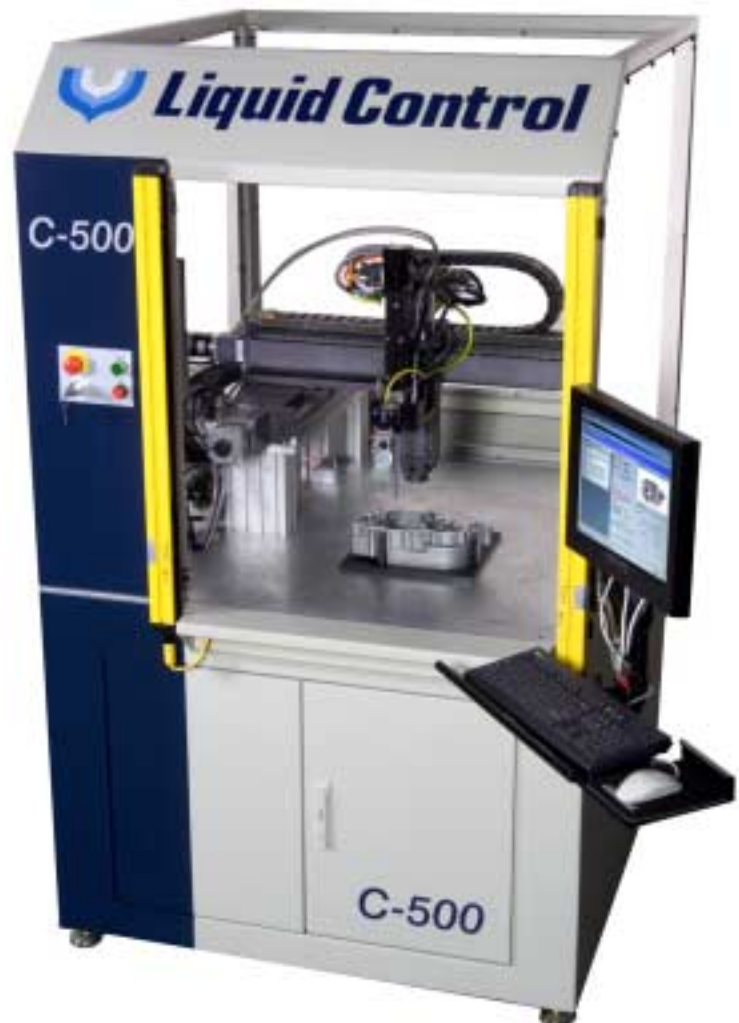
C500 Automation Platform with a PosiDot 20