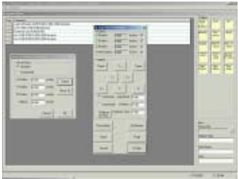
Windows Based Program